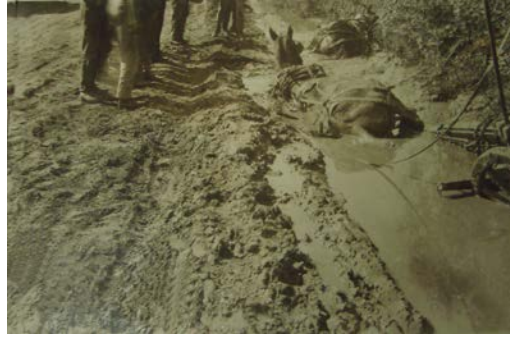
Horses in the Borger mud