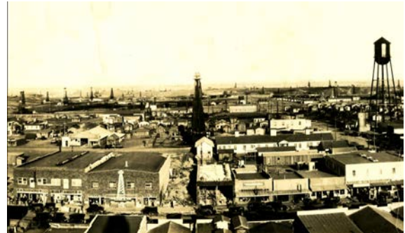
One year later