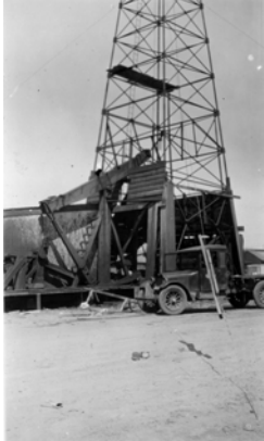
Oil well in town Center