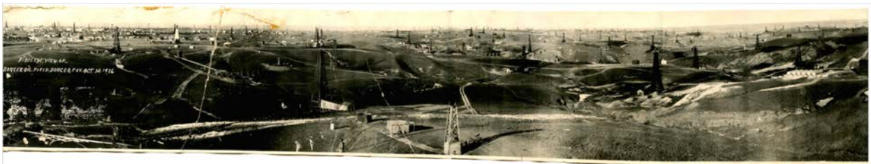
The Oil Patch