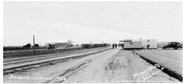
Borger as the Boom rolled in.